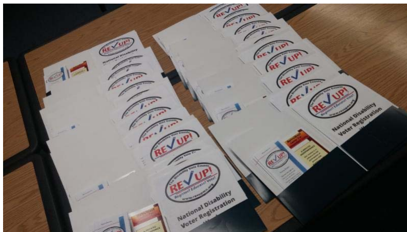
Disability Voter Registration Week packets ready for MWCIL libraries

The National REV UP has formed new partnership with EveryLibrary . MetroWest Center for Independent Living has asked libraries in our service area to support our drive to register people with disabilities. If you aren't registered to vote, stop by your library and see if they are participating. Or visit revupma.org , sign up with Rev Up, and register to vote!