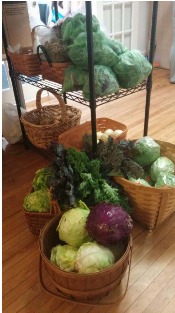
The first beautiful donation

Our Information and Referral expert has compiled a list of all of the farmers markets in our service area. Many of them accept SNAP benefits. Download the flyer for a list of local Farmer's Markets.