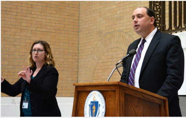
Senator Jamie Eldridge