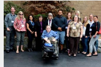
MetroWest Center for Independent Living