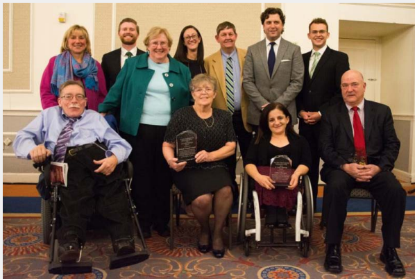
2015 Awards Gala

Over the next two months, there will be numerous hearings and State House events on PCA's, Housing, AAB Regulations and the MBTA. If you have opinions on these subjects, we highly recommend you attend and share your story. The Baker administration seems to be leaving no stone unturned as they slog through the complex and sometimes expensive state commitments. If we don't speak up, and let them know that we use and need these services, things might not change for the better.