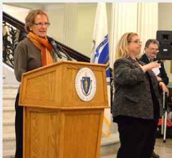
Rep. Ellen Story at IL Education Day

Help us protect our vital services by asking your state representative to sign onto Representative Ellen Story's amendment to H3400 and reinstate item 4120-0200.