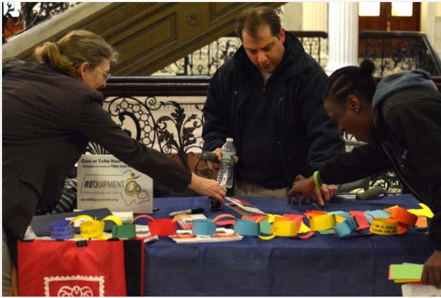
State Senator Karen Spilka