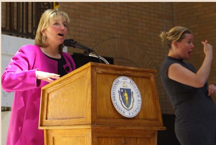
State Senator Karen Spilka at 2012 Education Day

Contact: Email info@masilc.org for more information.