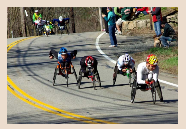
Wheelchair racers in 2011 Boston Marathon

For more photos and links to racer information, visit our <u>facebook</u> <u>photo gallery</u>.