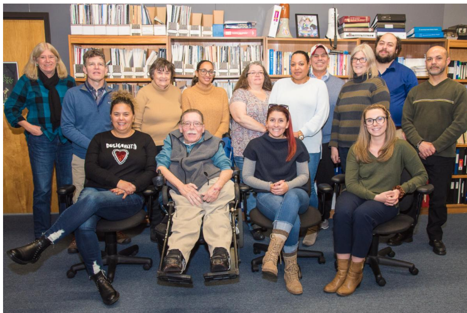
2020 Staff (visit the staff page for more info!)