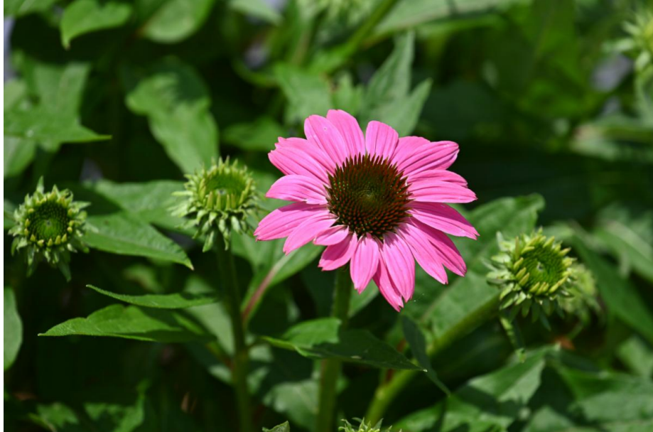
Echinacea - Coneflower