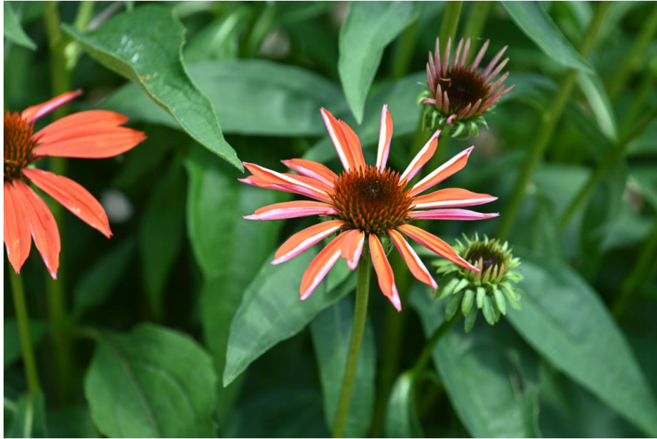
Echinacea - Coneflower