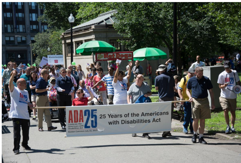
Start of 2015 ADA March in Boston