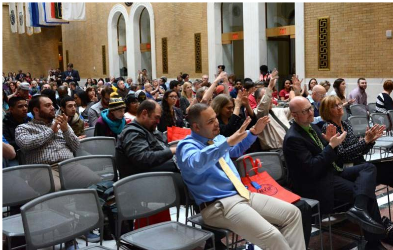
IL Ed Day 2016

For more information, contact Sadie at info@masilc.org .