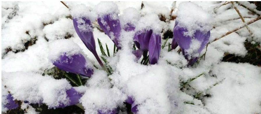
Crocuses poking through the snow (archives)